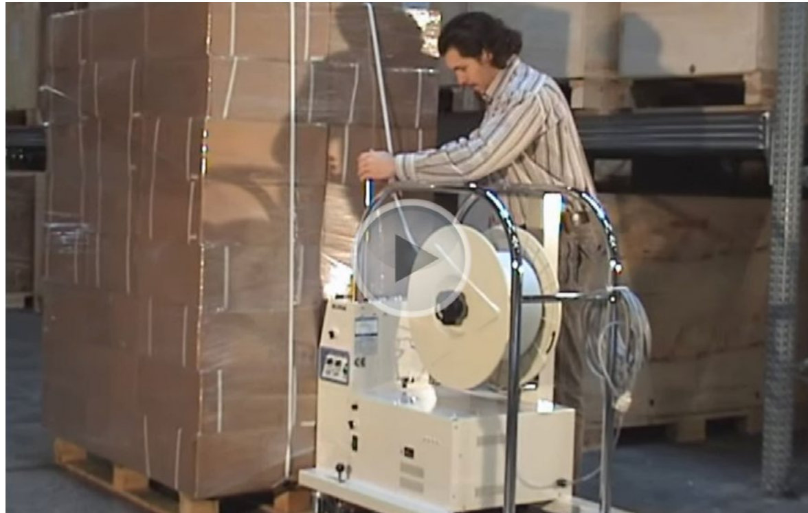
Digital Readers: Click the image to watch the D-53 PLT in action

The detail of the product(s), descriptions or specifications (for example weight, color, size, etc.) are only approximate values based upon a "standard model" of the representative product(s)/feature(s). There may be slight variations in the actual product design, dimensions, and functionality as compared to the information shown on our website and/or any supplementary product documentation, including but not limited to product brochures and spec sheets.