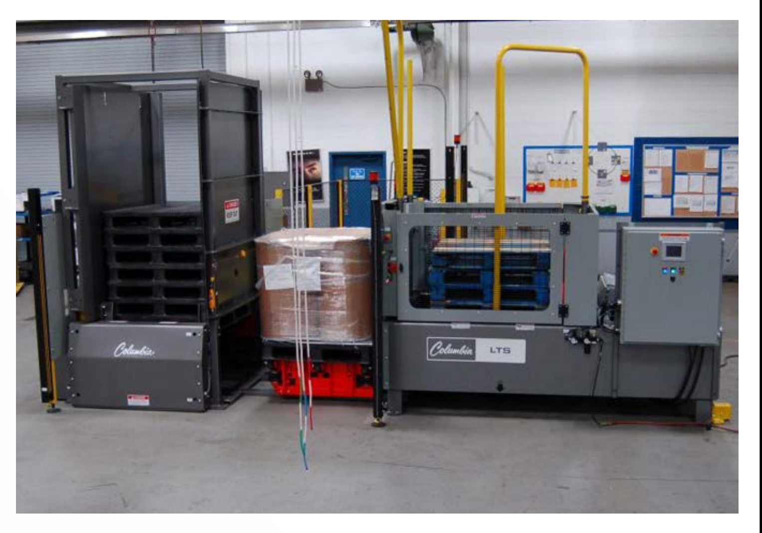
Web users: click here to view the LTS-PD in action